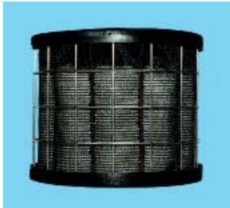
Triton Media Cartridge