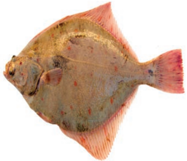
The effects of copper on aquatic organisms can be direct or indirect

Brief exposure to copper at environmentally realistic concentrations can impair the function of olfactory receptor neurons in coho salmon ; longer exposures can kill these neurons, as demonstrated by Baldwin et al. (2003). When juvenile coho salmon were exposed for 30 minutes to 20 µg/L copper, electrophysiological recordings from the olfactory tissues indicated an 82% reduction in olfactory response (McIntyre et al., 2008). Exposure of juvenile