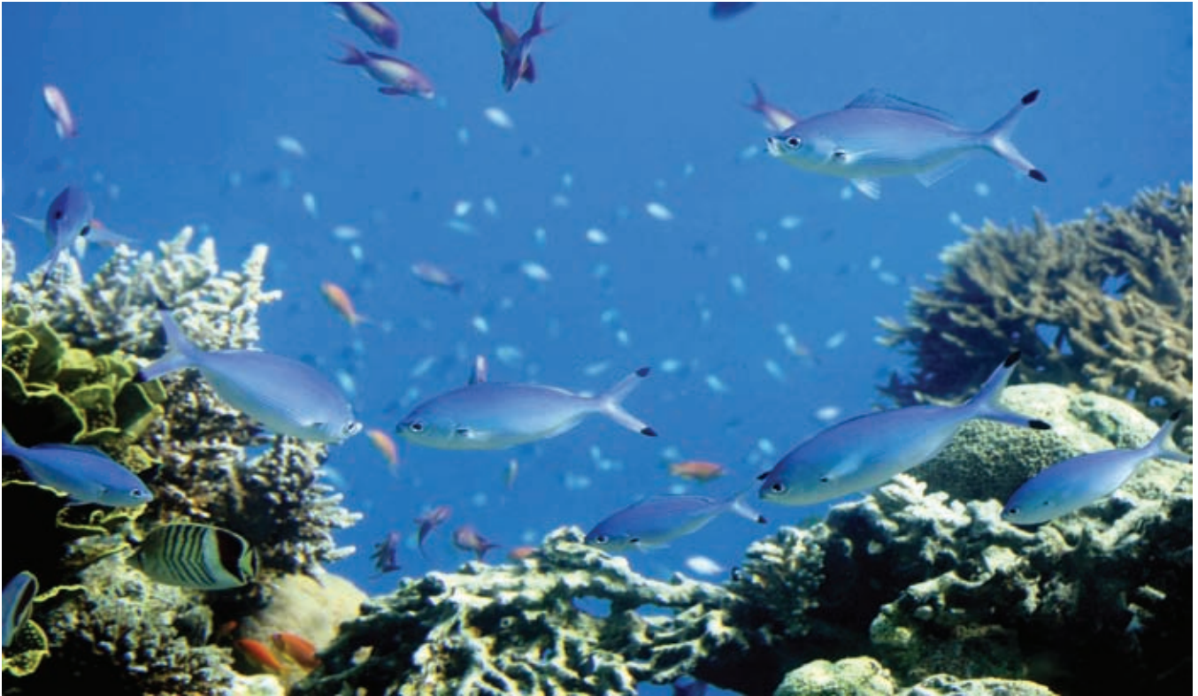
Exposure to copper concentrations can make fish lose their sense of smell and, therefore, reduce their appetite and food intake