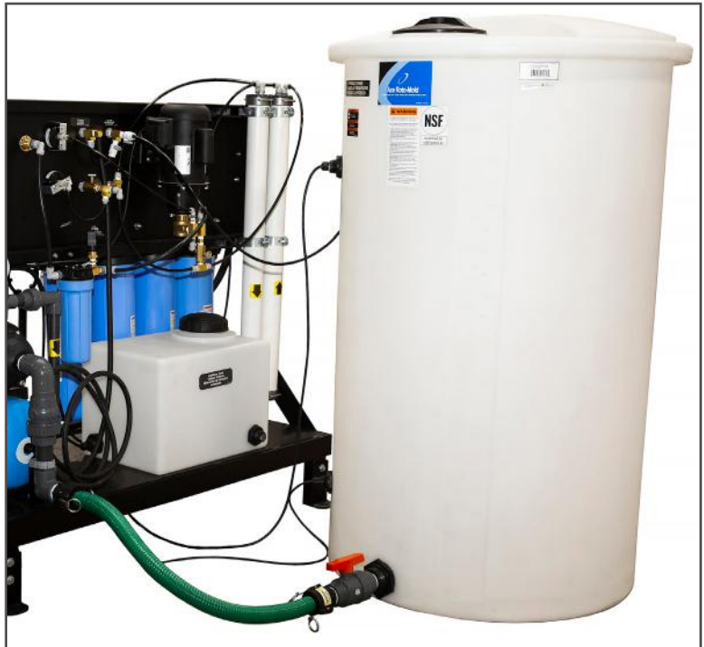
250-gallon holding tank