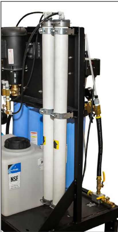
Reverse osmosis membranes