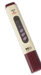
TDS meter, 33-0653